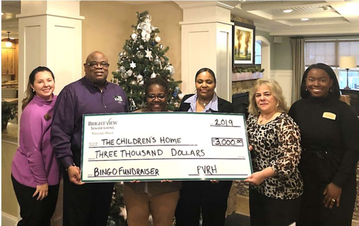
Brightview Senior Living in Catonsville raised $3000 for The Children's Home at their Bingo Night.